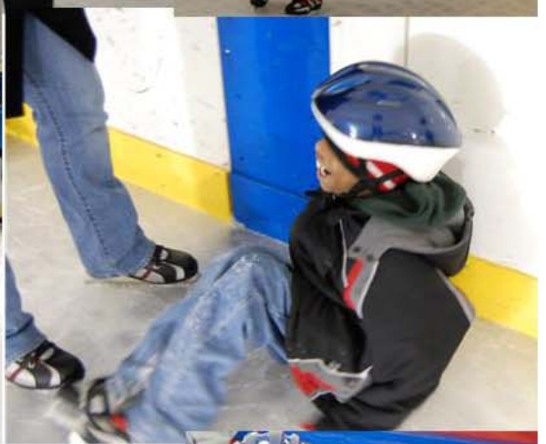
Ice Skating Trip February 6, 2010